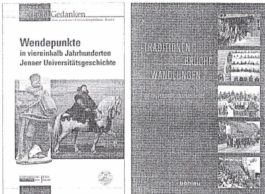
Fig. 3: Two jubilee publications celebrating the anniversary of Jena University

context. 21 The concluding synthesis on the history of Jena University was based on long years of systematically allocated scientific theses together with several anthologies and conferences. 22 As a result, the Jena University can be considered the best researched German university of the nineteenth and twentieth century.