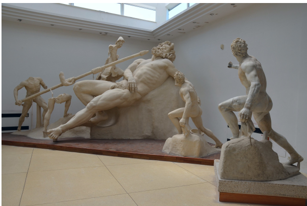
Fig. 11: Odysseus and his fellows blind Polyphemus (Odyssey 9, 166-566)

Reconstruction of a late Hellenistic statuary group (end of 1st century BC) from the villa at Sperlonga (reconstruction). Plaster (casts). Museo Archaeologico di Sperlonga.