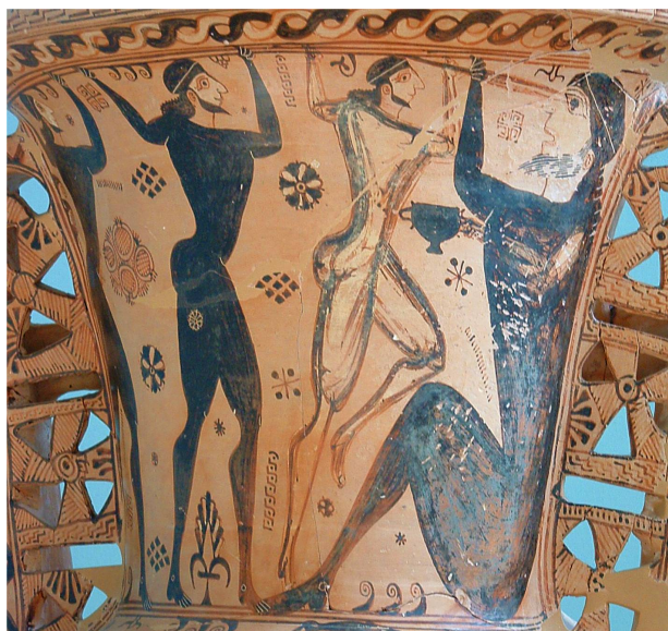
Fig. 2 – 6: Visual representations in the 7th to 5th century BC