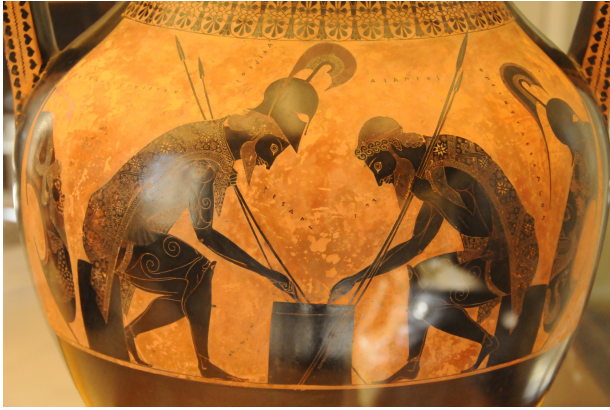
Fig. 6: Aias and Achilles playing a board game

Attic black-figure amphora by Exekias, c. 530 BC. Clay. Rom, Musei Vaticani, Inv. No. 16757.