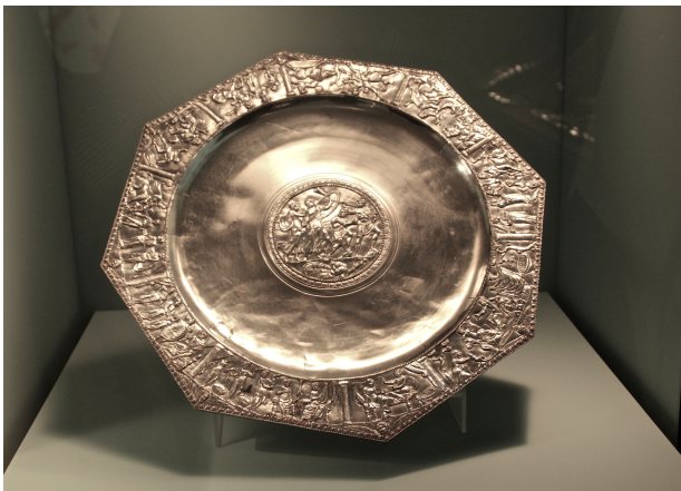
Fig. 12: Plate with relief depictions from the life of Achilles

c. 350 AD. Silver. Augst, Römermuseum, Inv. No. 62.1.