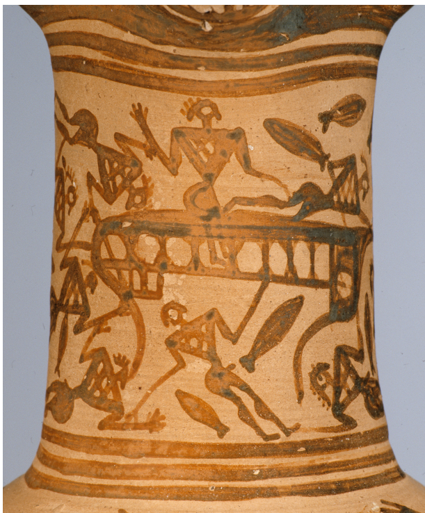
Fig. 1: Odysseus’ Shipwreck

Images of Homeric heroes from more recent periods have found little specific research interest, such as in Hellenistic pottery (‘Homeric cups’)[42], as decoration of Roman villas in reliefs (‘Tabulae Iliacae’)[43], sculptures (Villa of Sperlonga)[44] and wall paintings.[45] Late antique and early medieval representations of Odysseus have also been re-examined.[46] (vdH)