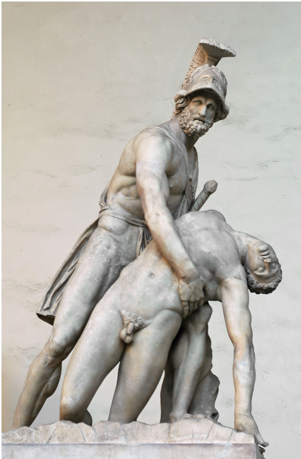
Fig. 9: Aias with the body of Achilles or Menelaus with the body of Patroclus

Roman copy of a Hellenistic statuary group (with modern additions). Marble. Florence, Loggia dei Lanzi.