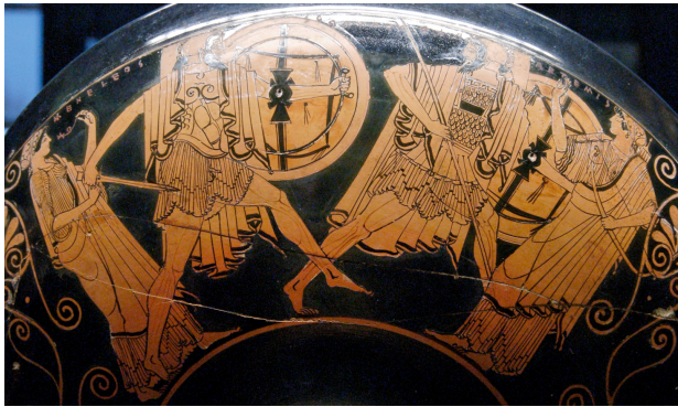
Fig. 3: Duel of Menelaus and Paris (Iliad 3, 250-461)

Attic red-figure drinking cup, c. 490 BC. Clay. Paris, Musée du Louvre, Inv. No. G 115.