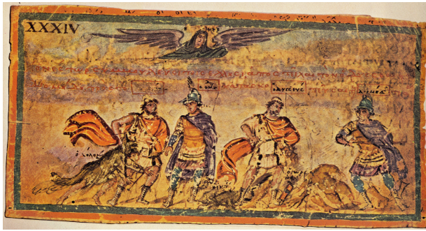
Fig. 13: Odysseus and Diomedes capture Dolon (Iliad 10)

Illustration in the Iliad Ambrosiana, 5th century AD. Milan, Bibliotheca Ambrosiana Cod. F 205 inf. Nr. 34.