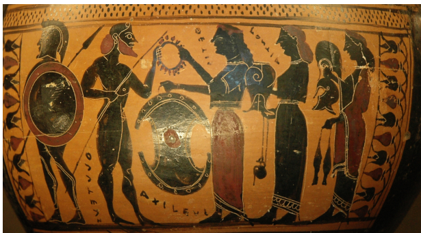
Fig. 4: Achilles receives the weapons of Hephaestus from Thetis (Iliad 19, 1-36)

Source: User:Jastrow / Wikimedia Commons Licence: Public Domain