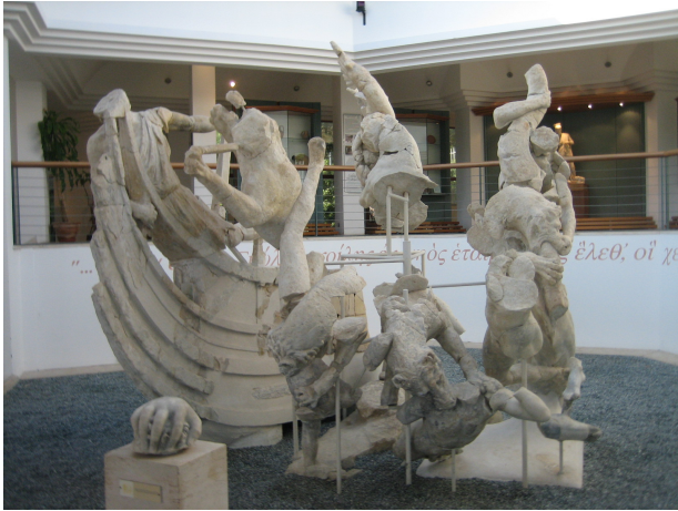
Fig. 10: Scylla attacks the ship of Odysseus (Odyssey 12, 222-259)

Late Hellenistic statuary group (end of 1st century BC) from the villa at Sperlonga. Marble. Museo Archaeologico di Sperlonga.