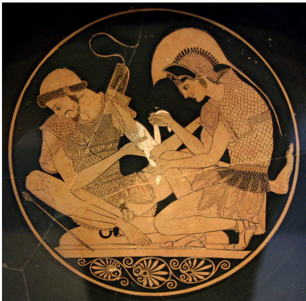
Fig. 5: Achilles puts a bandage on Patroclus' wound

Source: User:Jastrow / Wikimedia Commons Licence: Public Domain